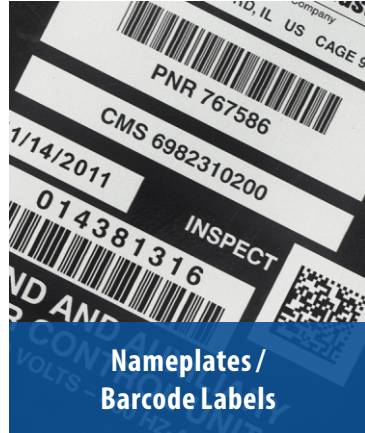
Nameplates / Barcode Labels