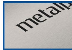
SATIN semi-gloss medium reflective material