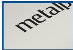
MATTE non-reflective with dull finish