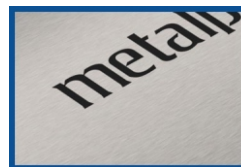
SATIN semi-gloss medium reflective material